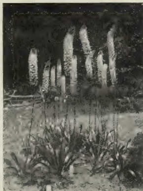
EREMURUS HIMALAICUS. Photographed in our Nursery.